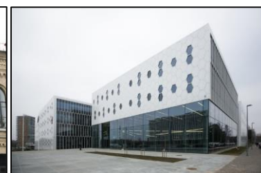
National Center for Physical Sciences and Technology